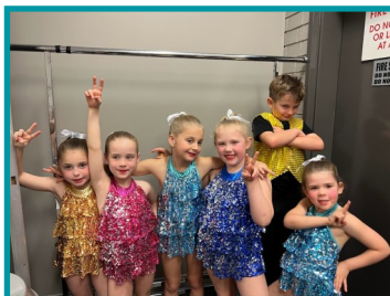
Junior Dance Group