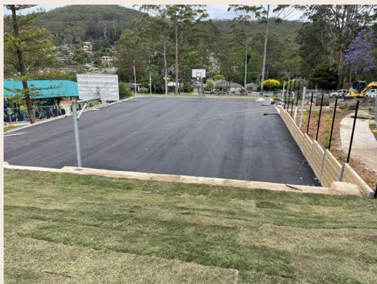
Basketball Court Progress