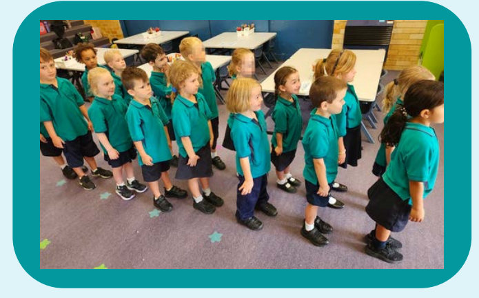
Presentation Day Assemblies are a time for our school to celebrate our success and show school pride.