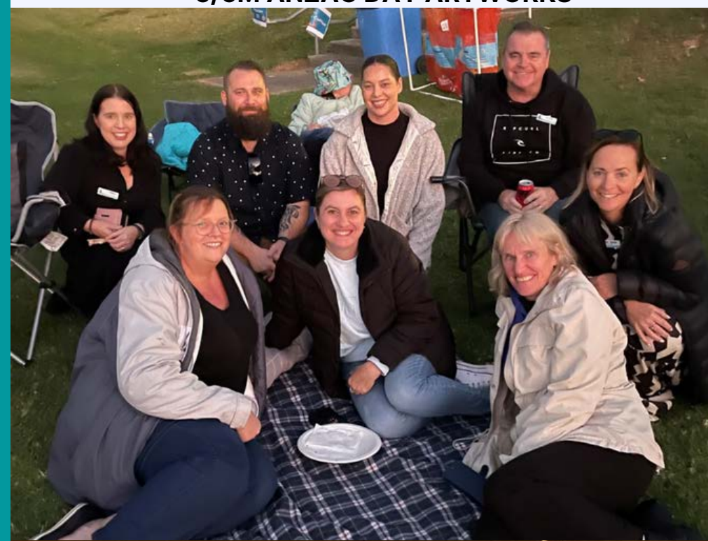
VALLEY VIEW TEACHERS AT OUR P&C MOVIE NIGHT