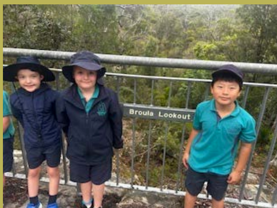
Stage 1 Teachers

A big thank you to our two parent volunteers for helping make this day a success. The instructors were impressed by our students' exceptional manners and positive attitudes. Our students proudly represented Valley View Public School, making it a memorable and successful day for all!