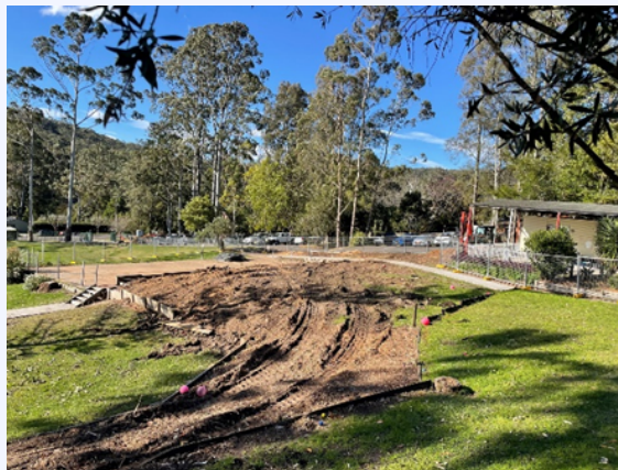
New Basketball Court