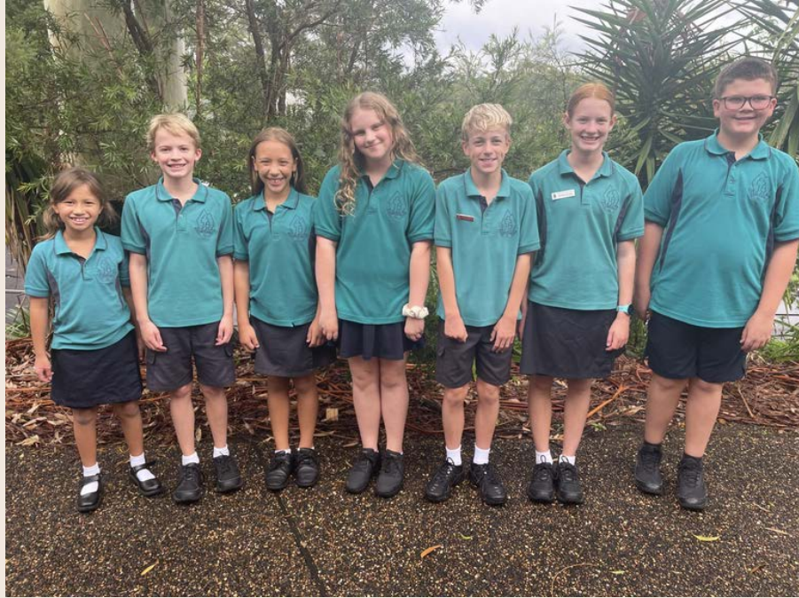
Age Champions for Swimming