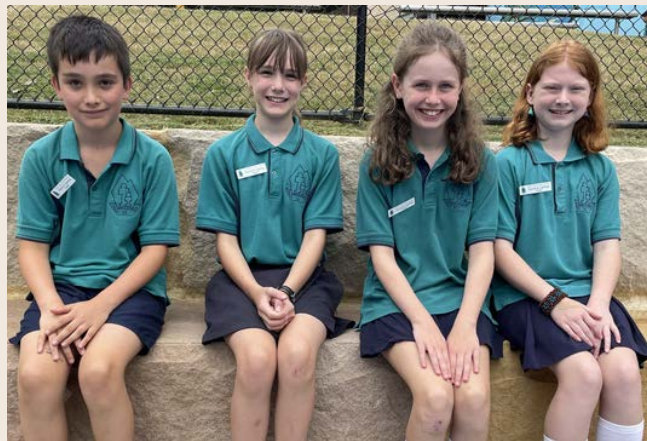
Sound & Lighting Team